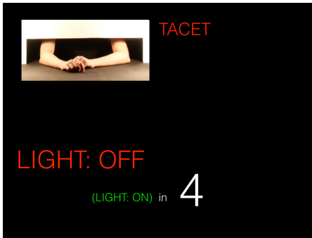
Figure 3.2: Gestural notation on Music from Somewhere (Score excerpt)