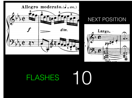
Figure 3.3: Traditional musical notation on Music from Somewhere (Score excerpt)